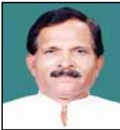
Shri Shripad Yesso Naik Hon'ble Minister of State (I/C) Ministry of AYUSH, Govt. of India President GB

The Institute is fully funded by Ministry of AYUSH, Govt. of India. The authorities and the officers of the Institute are - The President, The General Body, The Governing Council, The Director and such other committees, sub-committees, authorities and officers as may be appointed by the Governing Council, e.g. Standing Finance Committee, Scientific Advisory Committee, Academic Committee etc.